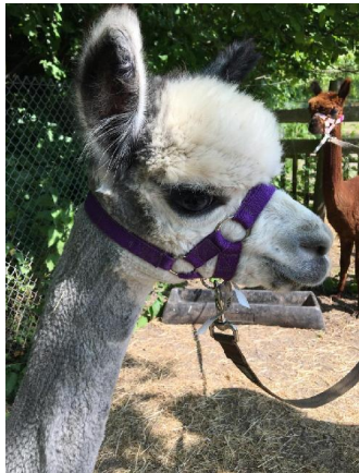
Hensting Santolina Body