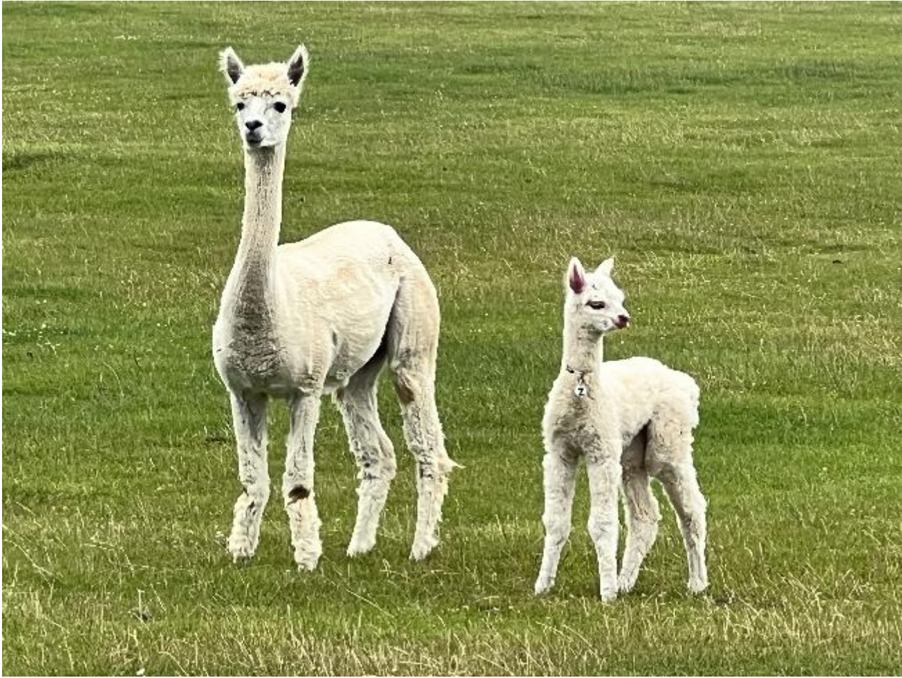
Barbie & 2023 cria Zeus