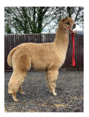
Classical MileEnd Finlo