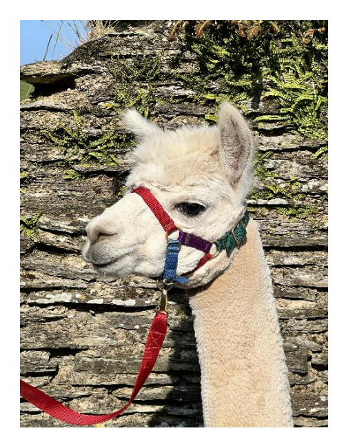
Mullacott Rio Grande (spots)