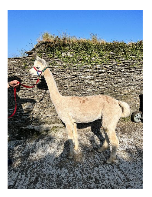
Mullacott Rio Grande (head)