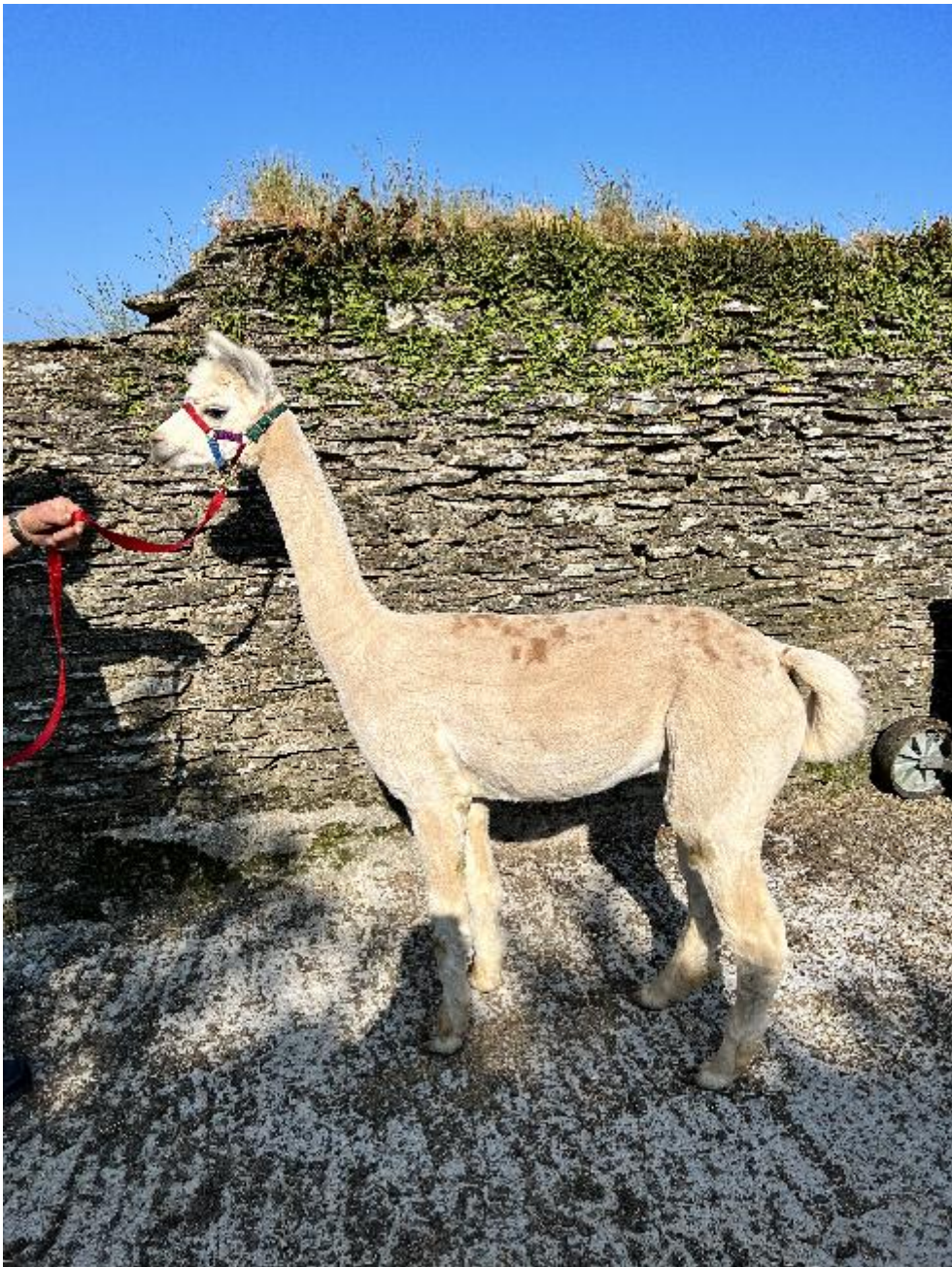
Mullacott Rio Grande (side)