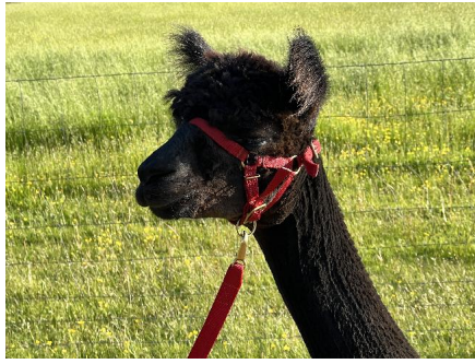
Mullacott Lucinda (side)