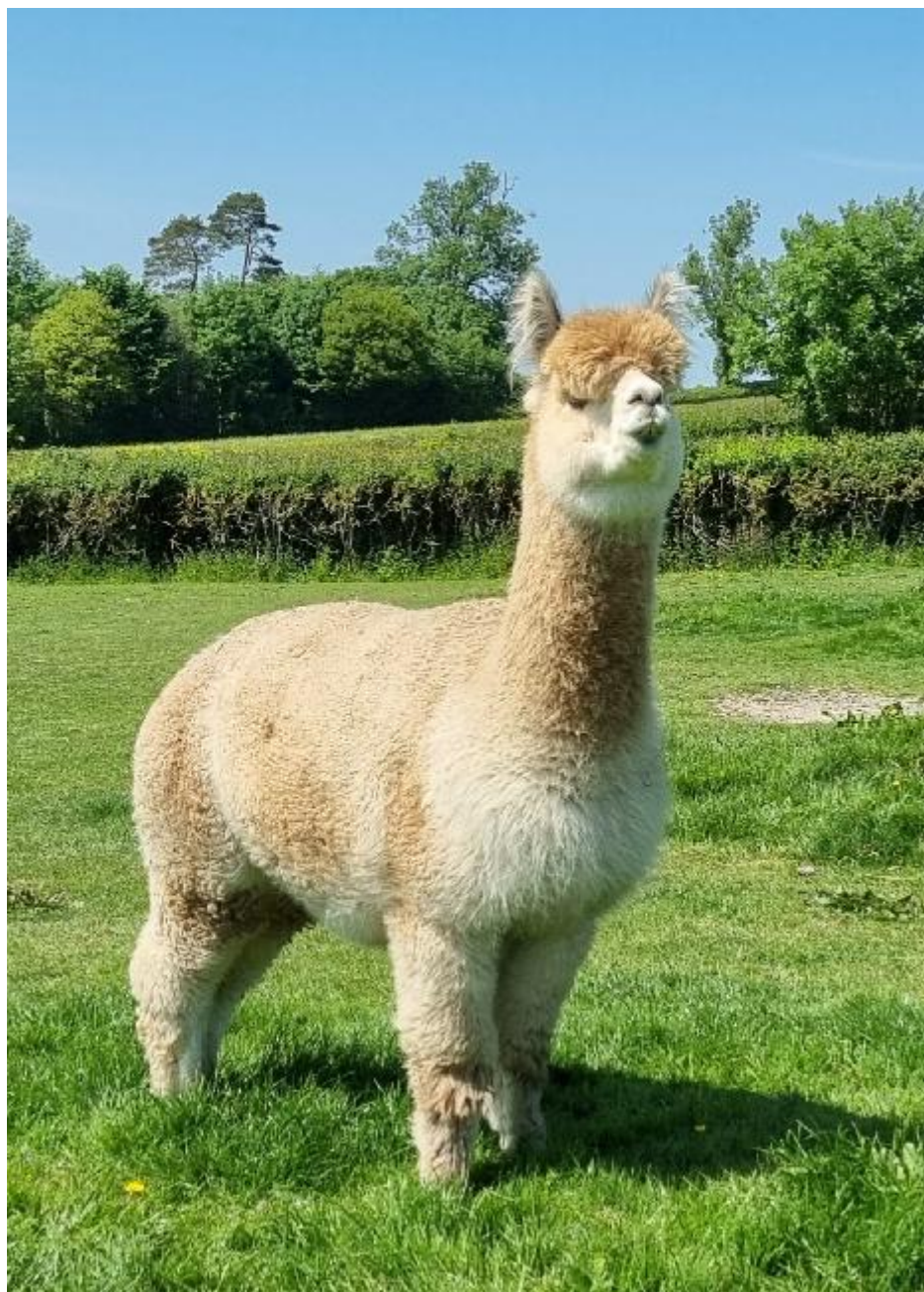
Patou Cinnamon 12 months fleece