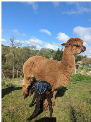
Alpaca Photo 3