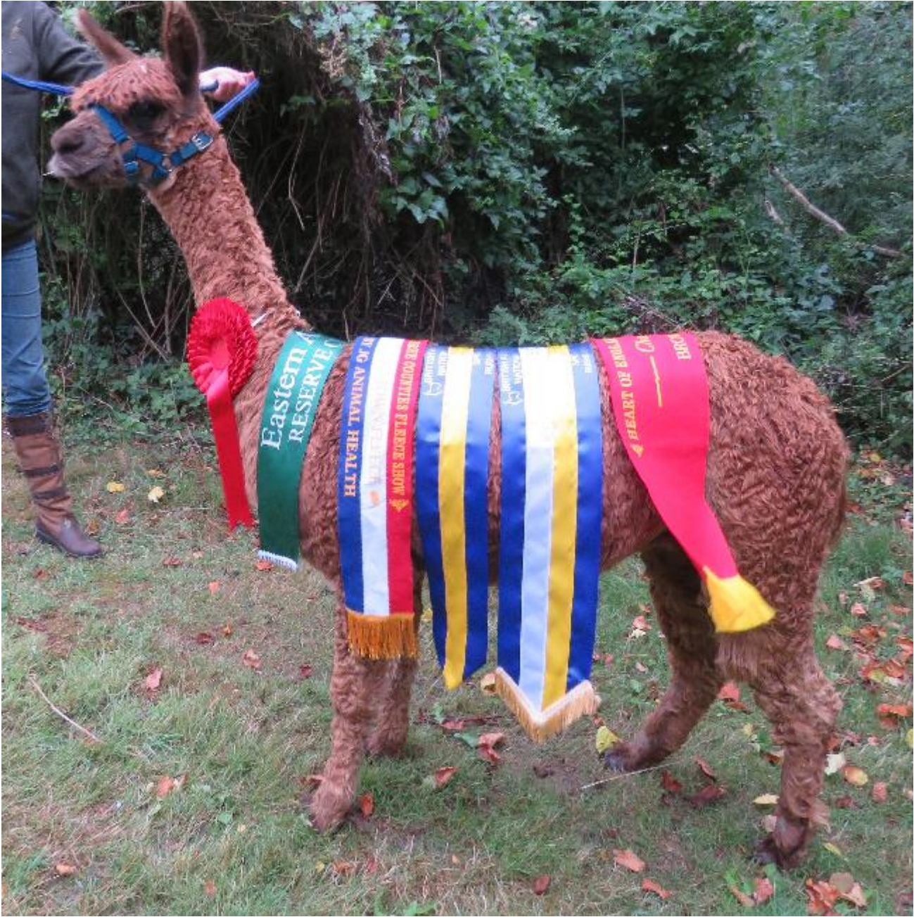
Park Side Bedivere