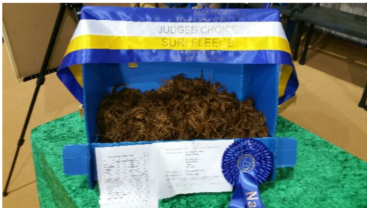
Champion Brown 2018 at Three Counties Fleece