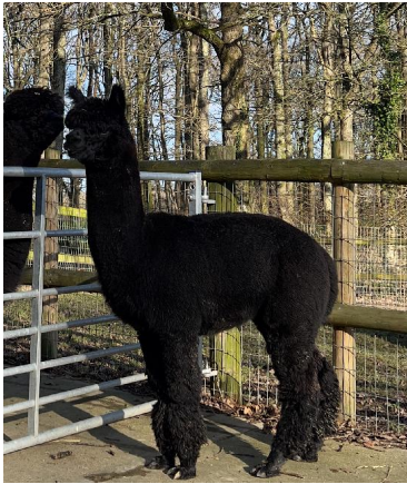
Alpaca Photo 3