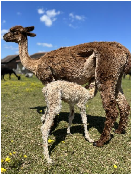
Cria 2022, Willow/Lensky mating