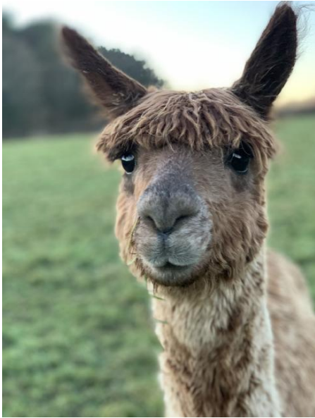
Willow with 2022 Cria