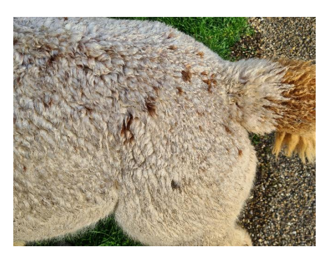
Alpaca Photo 3