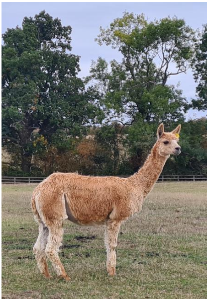
Alpaca Photo 1