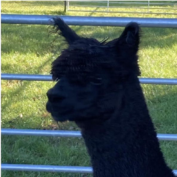
Tienda Molino Nairobi fleece