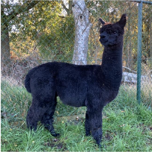
Tienda Molino Nairobi head