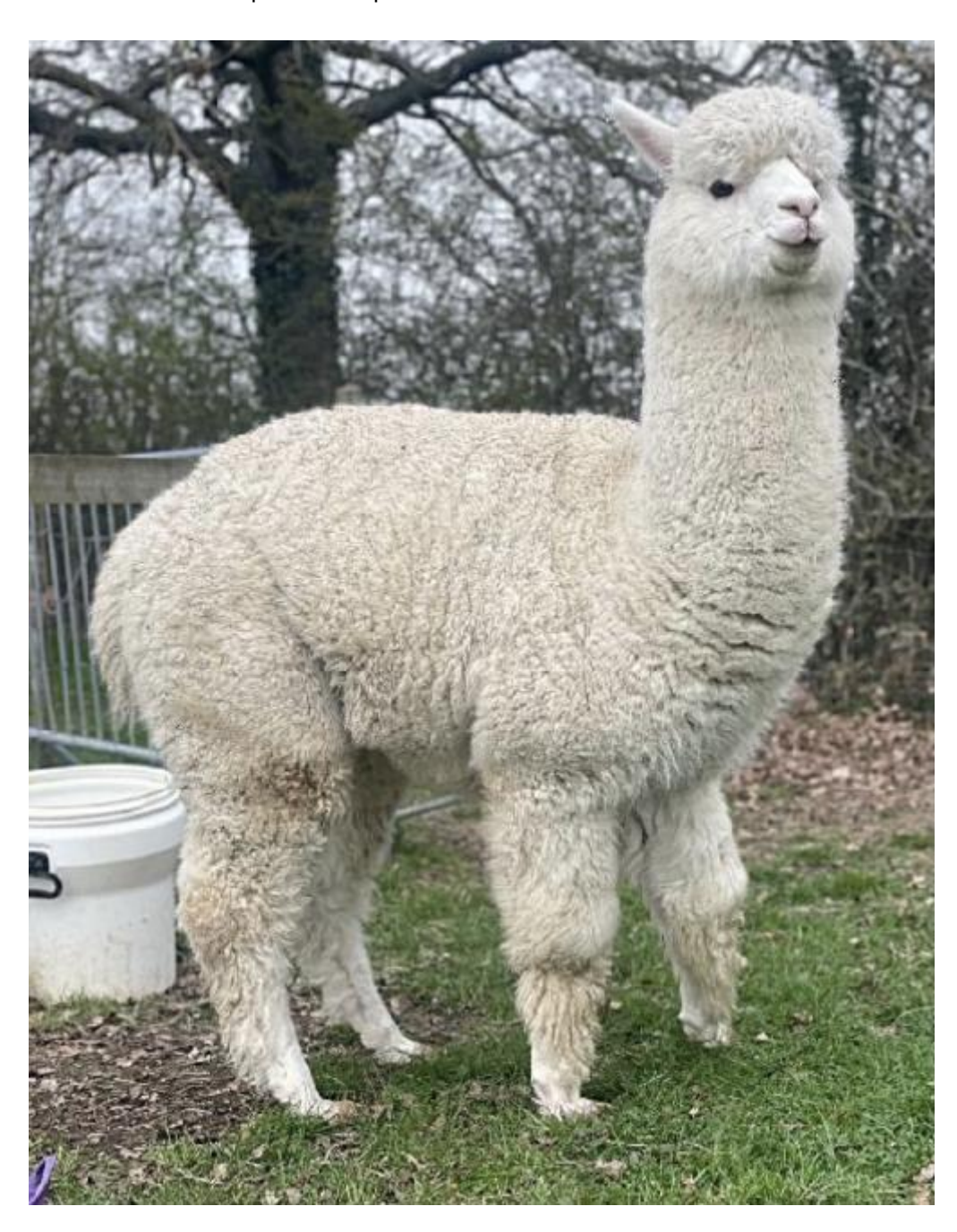
Lane House Remarquable Conquest