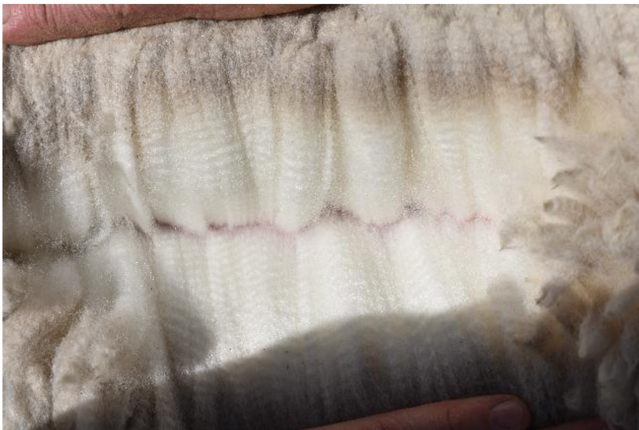
Fleece 2022 from cria from FAL Peruvian Jack of Diamonds