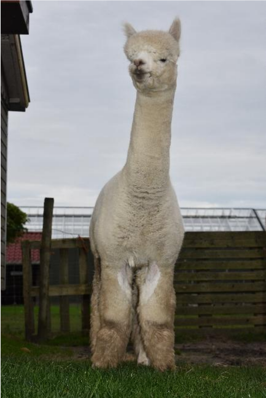
FAL Peruvian Jack of Diamonds