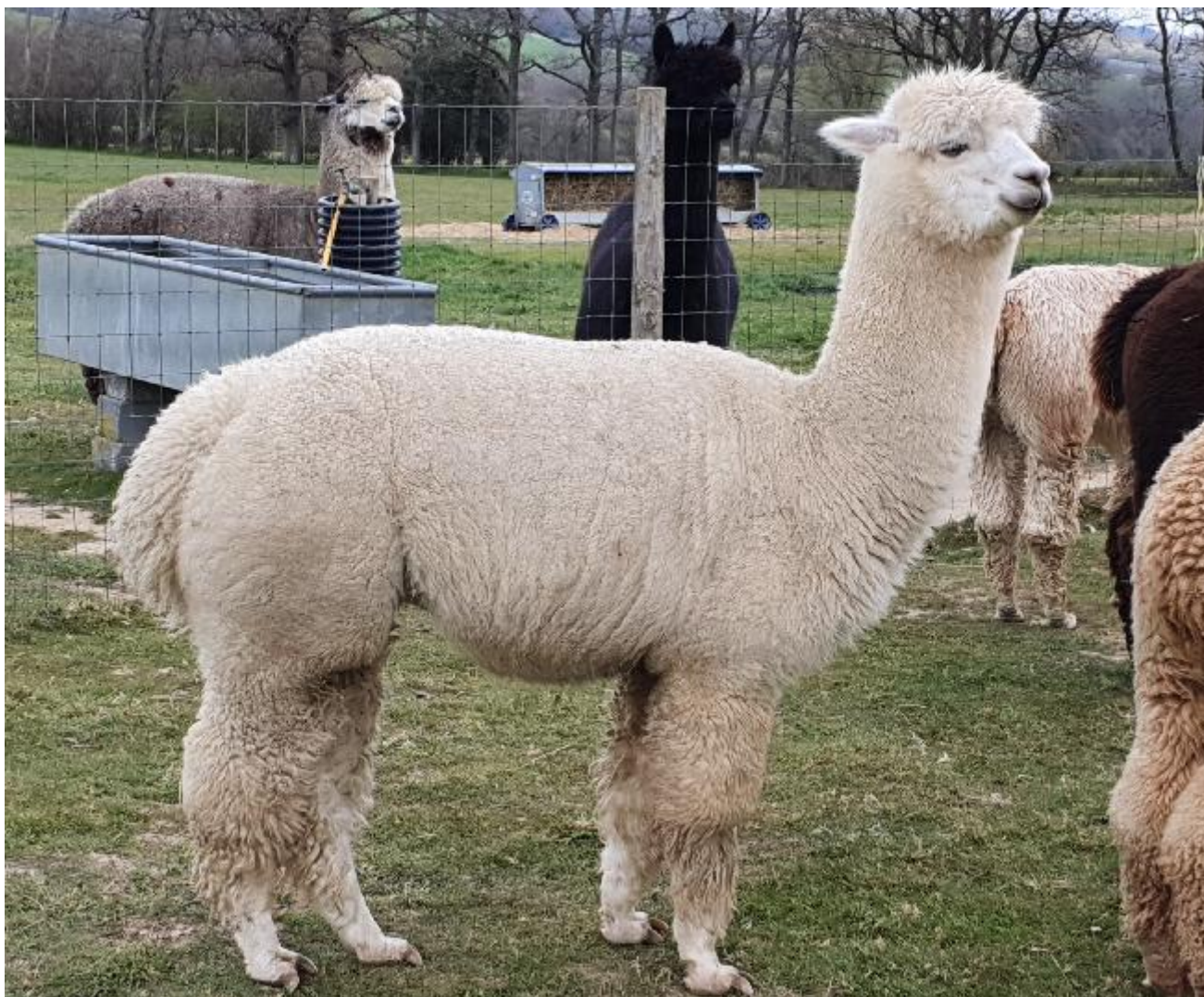
Delta first fleece