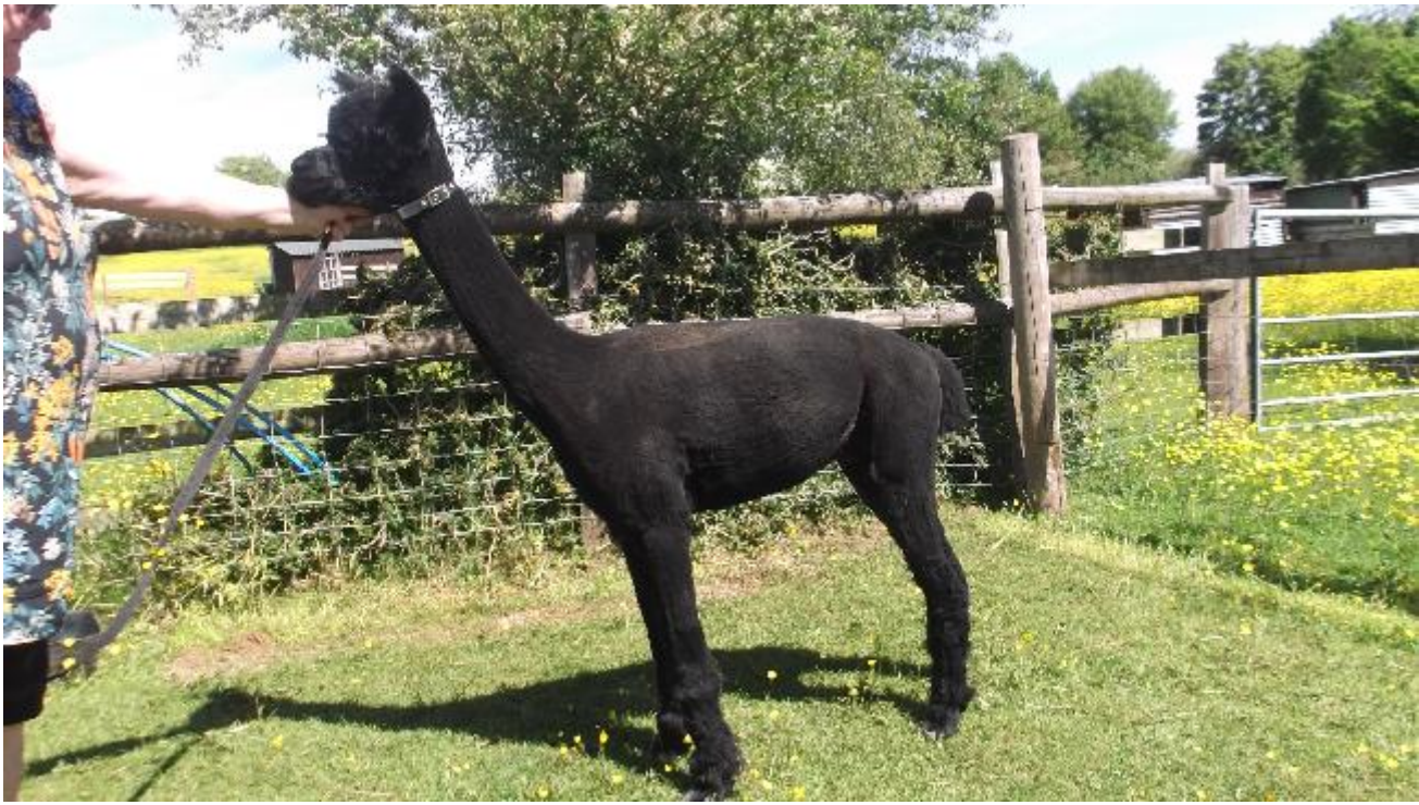
Alpaca Photo 3