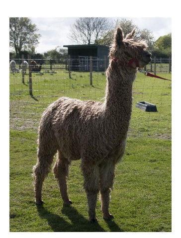
Alpaca Photo 1