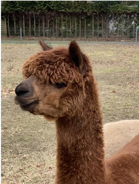
Alpaca Photo 3