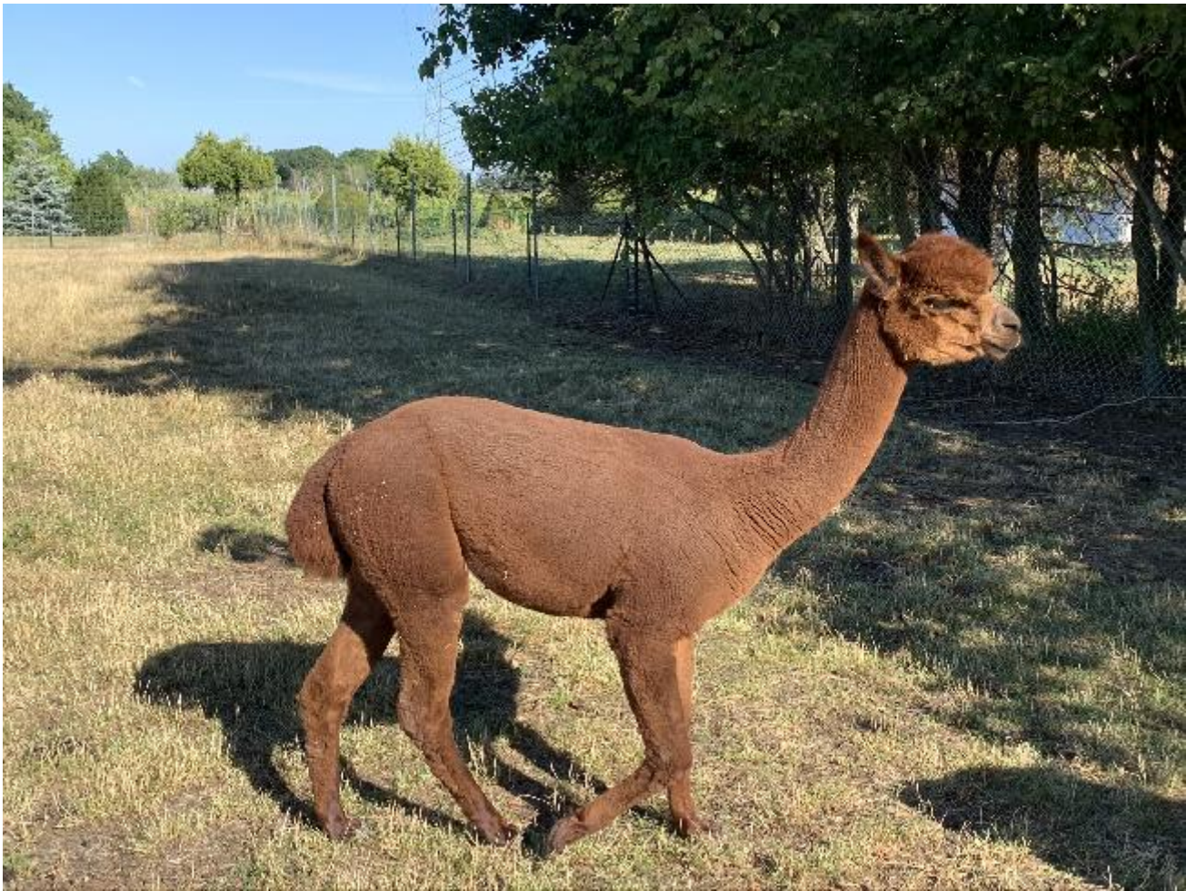
Alpaca Photo 1