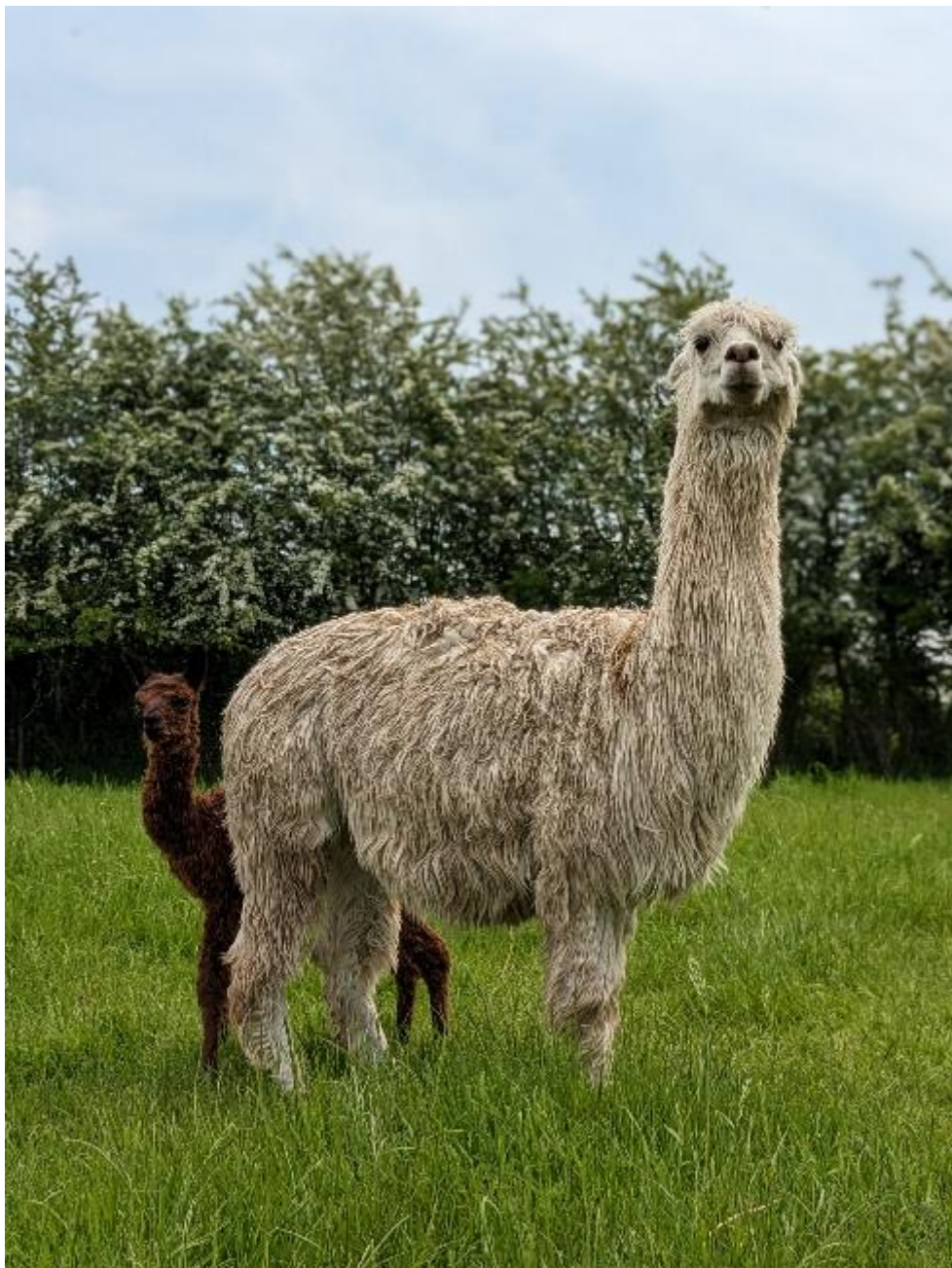
Spring Flower with Oriontree's Saturn, her cria at foot