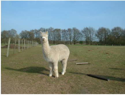
Alpaca Photo 2