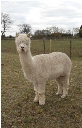
Bramble and 2023 cria