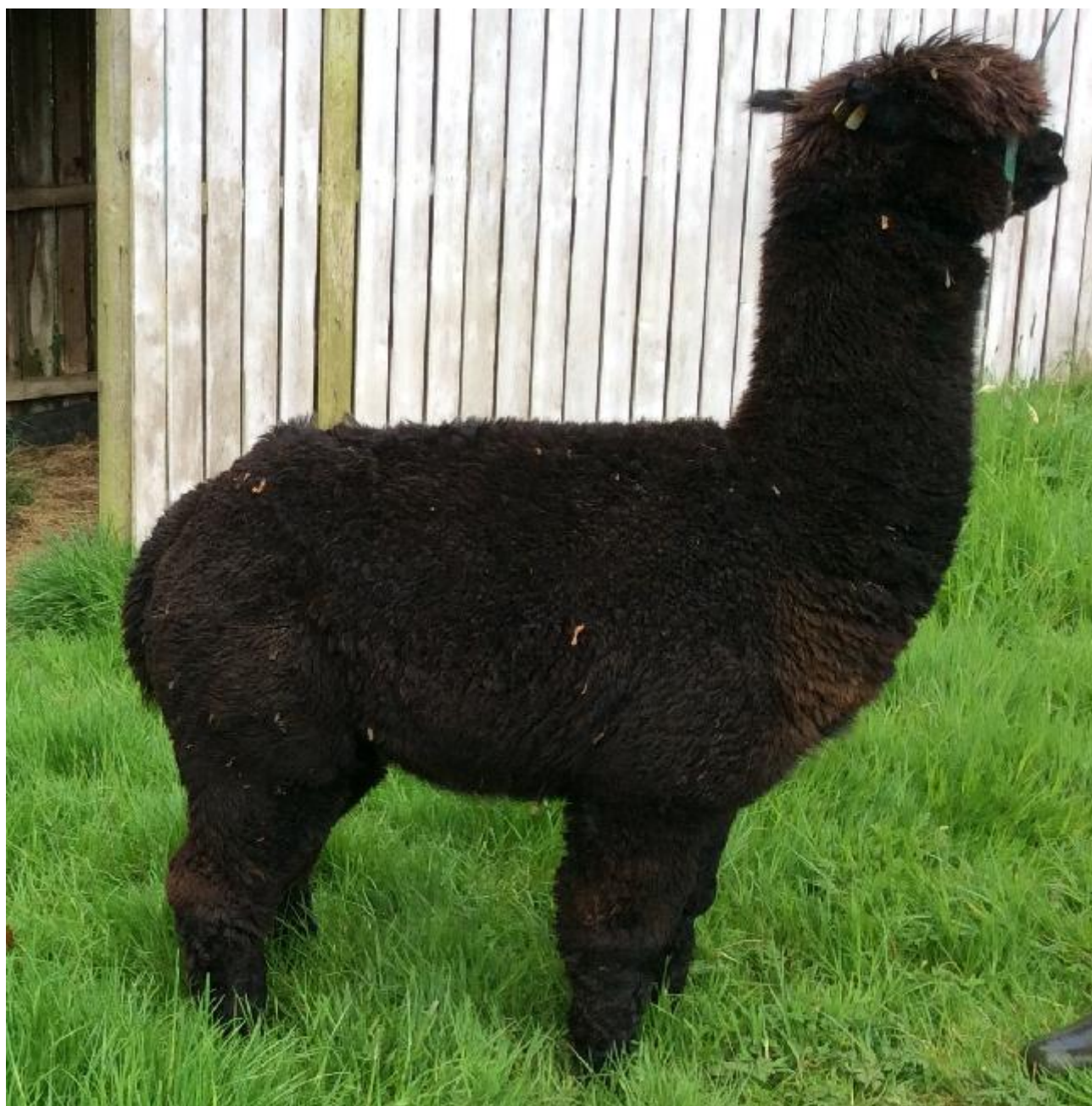
Alpaca Photo 1

Westmorland 1st.intermediate black colour champion