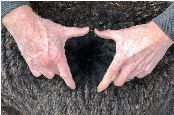
Inca Dubonnet - Dam of Inca Manhattan