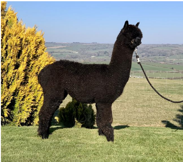
Inca Manhattan - Mar 2020