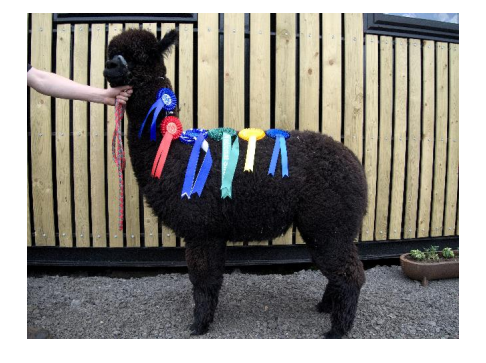
JandJ MacGyver 2