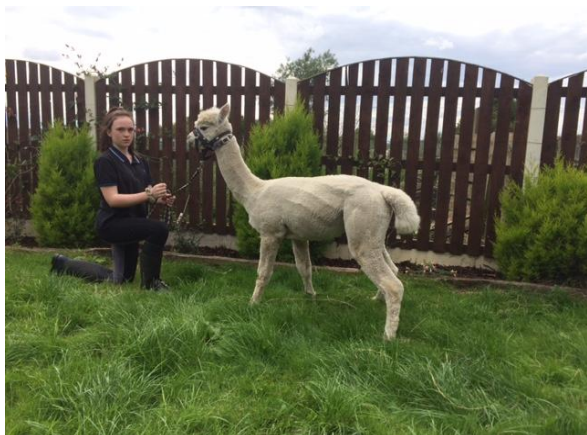
Alpaca Photo 1

Easily haltered. Lovely boy that runs well with other boys. Ideal for trekking/walking.