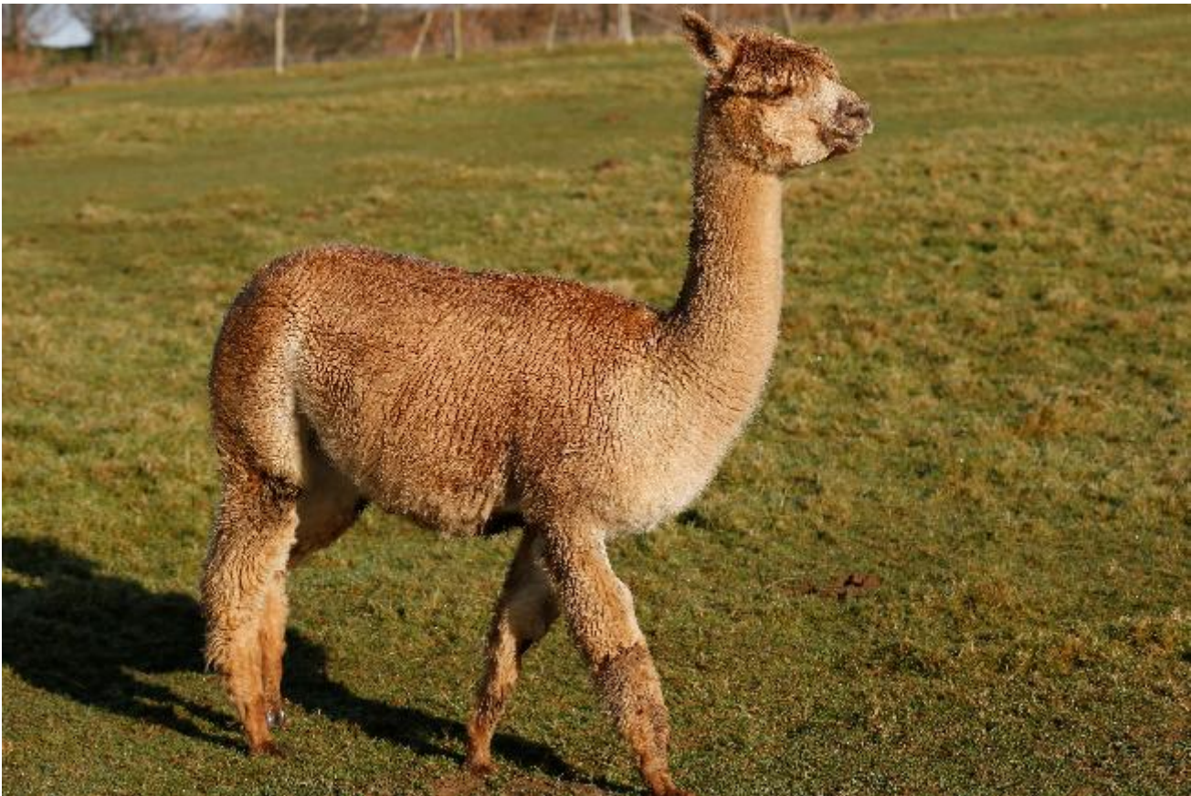
Upper Goosehill Harriet Head - Feb 18