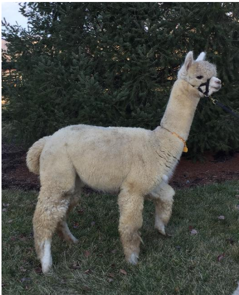
Alpaca Photo 1