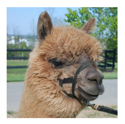
Alpaca Photo 3