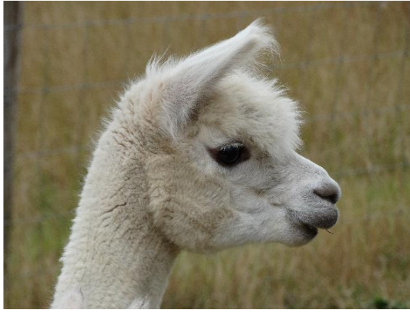
Ember with 2015 cria