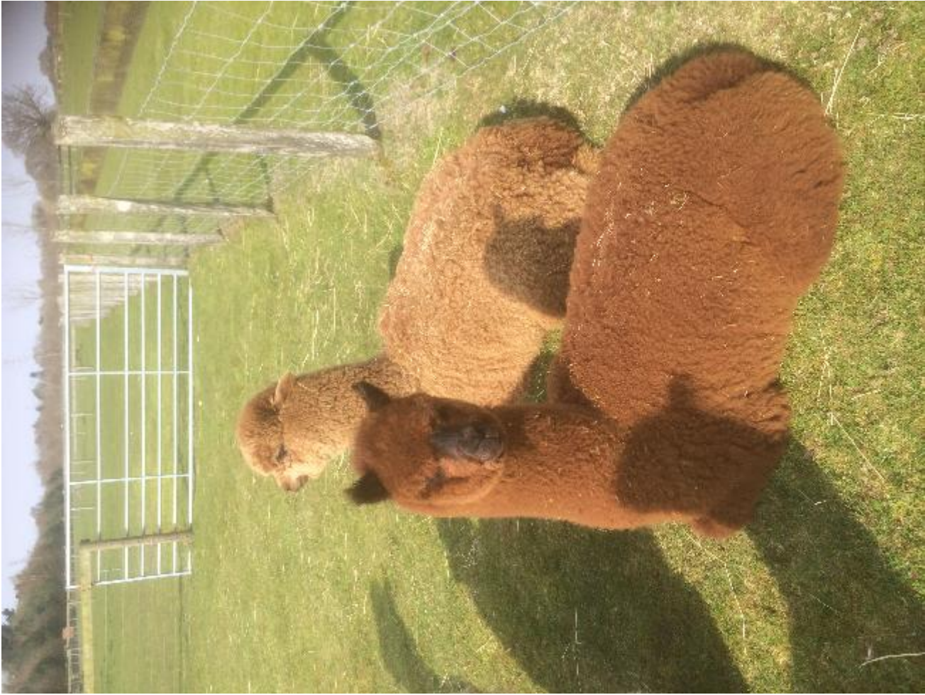
Madam Dijon in full fleece winter 2015