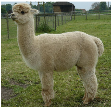
Alpaka Foto 2