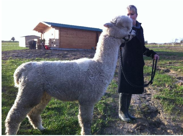
pahana fleece 1