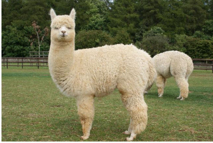
spartacus - 2nd fleece