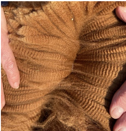
Limestone Red third fleece