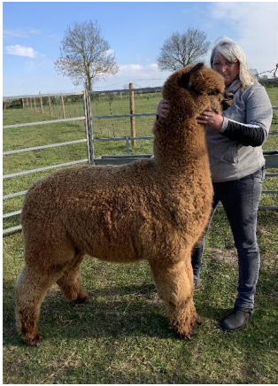
Limestone Red 2nd fleece