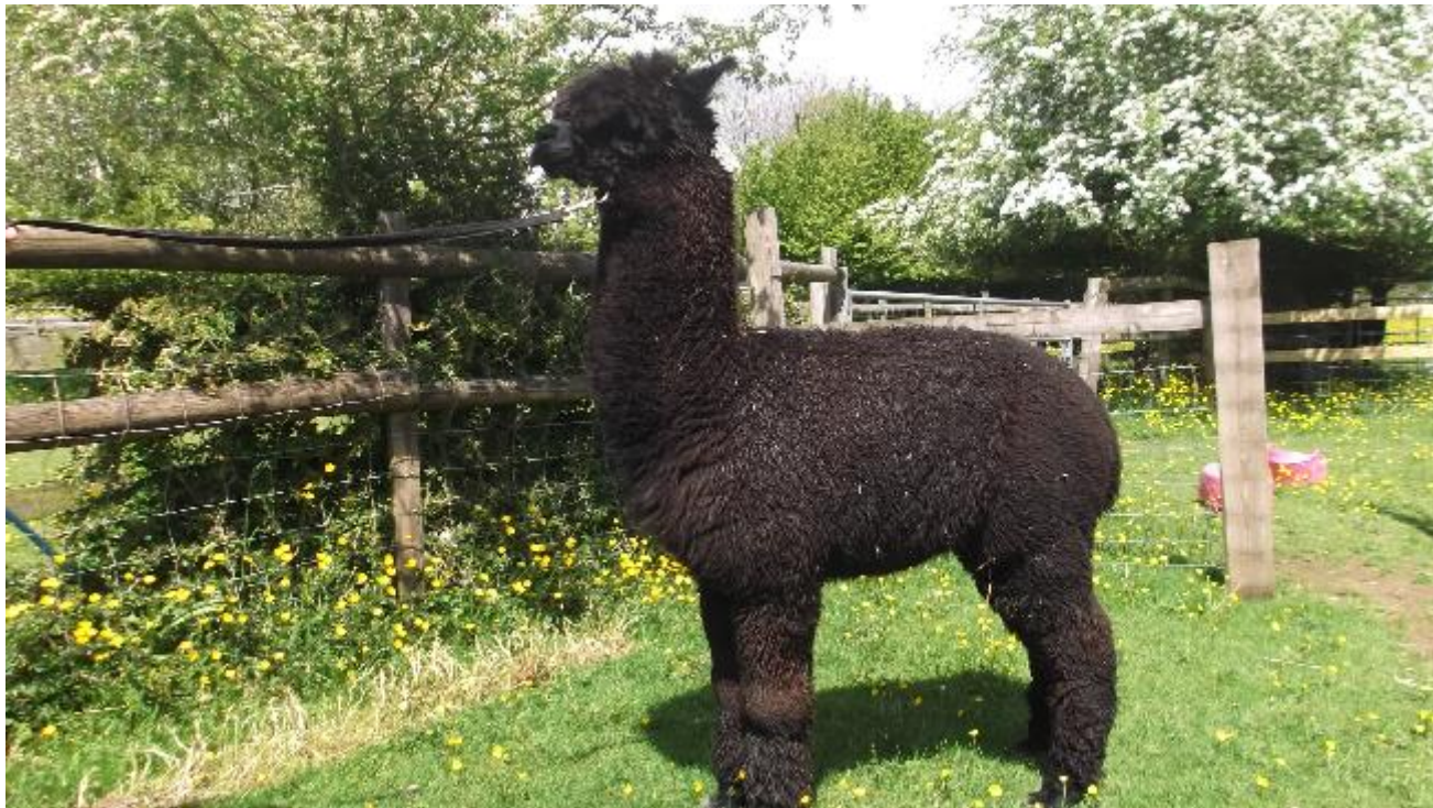
Alpaca Photo 1

FOR MORE DETAILS PLEASE RING MOB 07790674334 UK OR EMAIL lynnpepper56@gmail.com